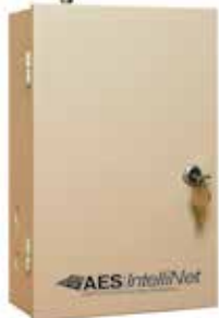
For New Systems 7058-IPD1