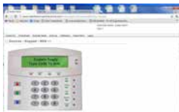
Any Personal Computer with Internet access