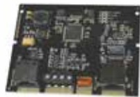
Add SiteLink 24 Interactive Services to Existing AES Subscribers – 7659-IPD1-R Module

AES-IntelliNet's new interactive products combine IntelliNet mesh radio technology for delivery of alarm and other critical signals plus SiteLink24 Interactive Security Services delivered via high speed internet. The result is unmatched reliability and technological consistency since both AES-IntelliNet and the Internet are not subject to the forced technology sunsets and costly forced upgraded every x number of years like cellular-based services.