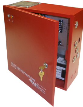
741 10A Power Supply with Enclosure